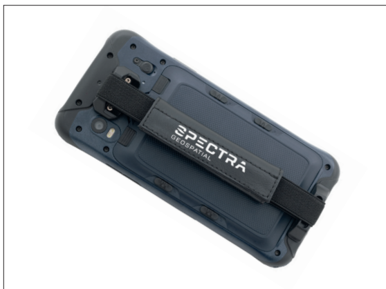
MobileMapper 60 handheld with MobileMapper field software